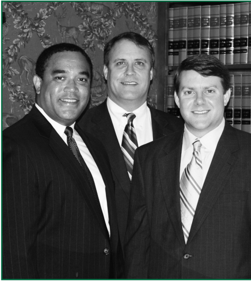
Leaders in car accident claims and litigation