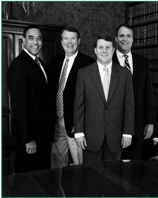
Leaders in car accident claims and litigation